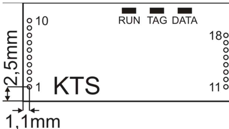
Figure 1: Module pinout